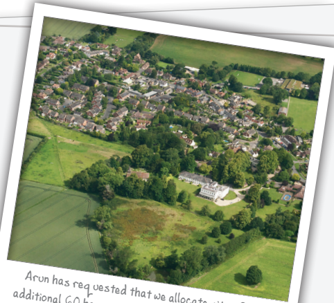
Arun has requested that we allocate sites for an additional 60 homes in our Parish which we have done!